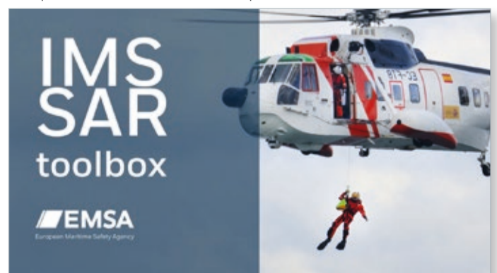
EMSA offers support to national authorities enabling an efficient monitoring of SAR activities.

EMSA recently published a short overview of the Search and Rescue toolbox available to national authorities through the Agency's Integrated Maritime Services. The comprehensive maritime traffic picture provided by the IMS allows for efficient monitoring of SAR activities, marking distress situations and search and rescue assets. When an emergency or incident occurs, national authorities have access to a SAR toolbox which allows them to monitor SAR patterns and mobilised assets using the integrated track functionalities. The toolbox also strengthens preparedness as it gives access to EU maritime authority contacts and early warnings for potentially dangerous situations through the algorithms provided by Automated Behaviour Monitoring alerts. IMS interfaces also link to Earth Observation imageries, products and services to offer a comprehensive maritime traffic picture.