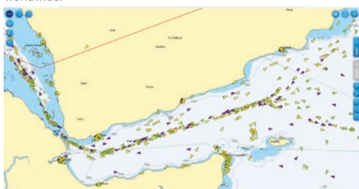
Maritime traffic off the Horn of Africa as displayed on EMSA's Integrated Maritime Services (IMS) platform.