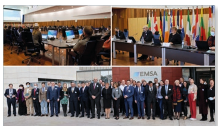
Workshop participants highlighted 'real time exchange of information with shore' as one of the key strengths of using RPAS for maritime surveillance