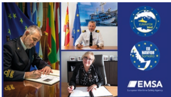
This form of cooperation is a great example of how the Agency is serving maritime security and enforcement communities worldwide.

EMSA is supporting EU Naval Force operations – Atalanta and Irini – following the signature of two cooperation agreements with EU NAVFOR-Somalia (Operation Atalanta) on the one hand and EUNAVFOR MED (Operation Irini) on the other. Operation Atalanta targets counter piracy and the protection of vulnerable vessels and humanitarian shipments off the coast of Somalia, while Operation Irini seeks to enforce the UN arms embargo on Libya and in doing so contribute to the country's peace process. By cooperating with EMSA in the areas of maritime security and surveillance, multiple sources of ship specific information and positional data can be combined to enhance maritime awareness for the EU Naval Force in places of particularly high risk and sensitivity. The support provided by EMSA comes in the context of the EU's Common Security and Defence Policy.